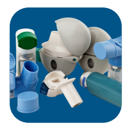
2. Gather supplies and make sure the inhaler is clean, free from foreign objects, & within the expiration date.