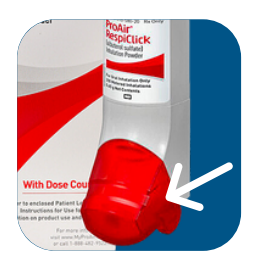
3. Make sure the RespiClick cap is closed and held upright,