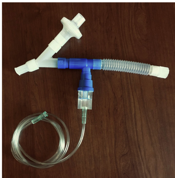
FIGURE 5. Nebulizer with a 1-way valve and expiratory filters.

targeted in the 1-5 \mu\text{m} range. 33 In the setting of nebulized therapy, most of the aerosolized particles are medical aerosols defined as medication from the chamber not the patient. Unless contaminated, medication aerosols pose no risk. Risk of medication contamination in the chamber can be minimized by using a proper aseptic technique in preparing the chamber and by using appropriate filters, 1-way valves, and/or design to prevent patient-contaminated material from entering the chamber during expiration. There are also fugitive aerosols defined as aerosols released during expiration. Fugitive aerosols can be medication aerosols directly from the chamber or exhaled aerosols from the patient. Up to 50% of the aerosolization from a nebulized treatment is from fugitive emissions. Fugitive emissions can last indoors for several hours. 34 However, it is not known what proportional amount of medical versus patient-derived emissions make up fugitive aerosols. Furthermore, the risk of viral transmission with fugitive aerosols is unknown. Goldstein et al 35 performed a broad search of 2416 references to identify 22 studies meeting review criteria to examine the risk of viral transmission with nebulized treatment. The results were confounded by different nebulization types, varied levels of PPE, and design inconsistencies. The authors were unable to quantify a risk for nebulized therapy, but they could not rule out that nebulized therapies may increase viral transmission. 35