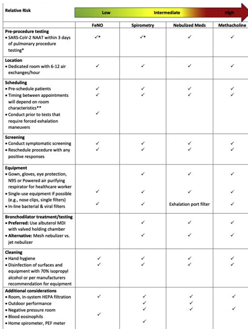
FIGURE 1. Preprocedural testing such as NAAT, location, scheduling, cleaning procedure, and additional considerations are listed in the left-hand column with checks for these listed items under the procedure where they are indicated. *Consider waiving the COVID-19 NAAT preprocedure test if the patient and staff are fully vaccinated and boosted. Any risk is further mitigated if the local prevalence of the virus is low, and the patient is not demonstrating significant acute airway symptoms. **For example, 12 air exchanges/h will remove 99% of room air in 46 minutes; 6 air exchanges/h will remove 99.9% of room air in 69 minutes. FeNO , Fractional concentration of exhaled nitric oxide; HEPA , high-efficiency particle arrest; MDI , metered dose inhaler; NAAT , nucleic acid amplification test; PEF , peak expiratory flow.

testing of select chronically symptomatic patients who lack other symptoms of COVID-19 infection.