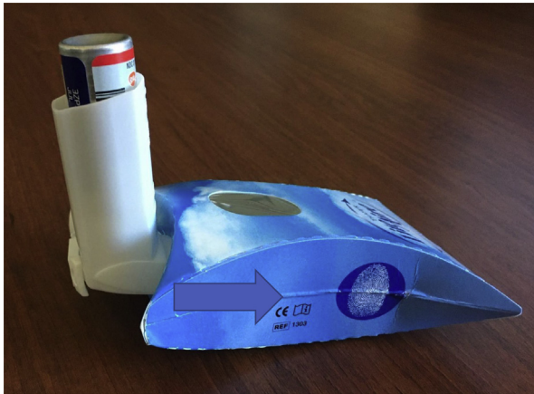
FIGURE 4. Metered dose inhaler with a single-use valved holding chamber. Example shown is: https://www.macgill.com/products/respiratory/peak-flow-meters-spacers/liteaire-dual-valved-holding-chamber.html . The arrow points to the valved holding chamber.

alcohol (or equivalent) or the disinfectant recommended by the manufacturer.