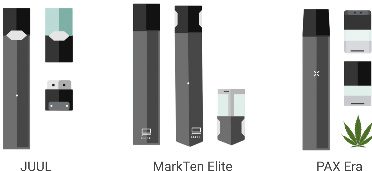
FIGURE 2. Popular pod mod devices currently on the market. Created in Biorender.com .

Simulation modeling used to estimate the population-level benefits and harms of e-cig use in the United States 36 noted that although e-cig use would lead to smoking cessation in a proportion of current cigarette smoking adults, the number of adolescents and young adults expected to begin using combustible cigarettes through the use of e-cigs led to more harm than benefit to the population as a whole.